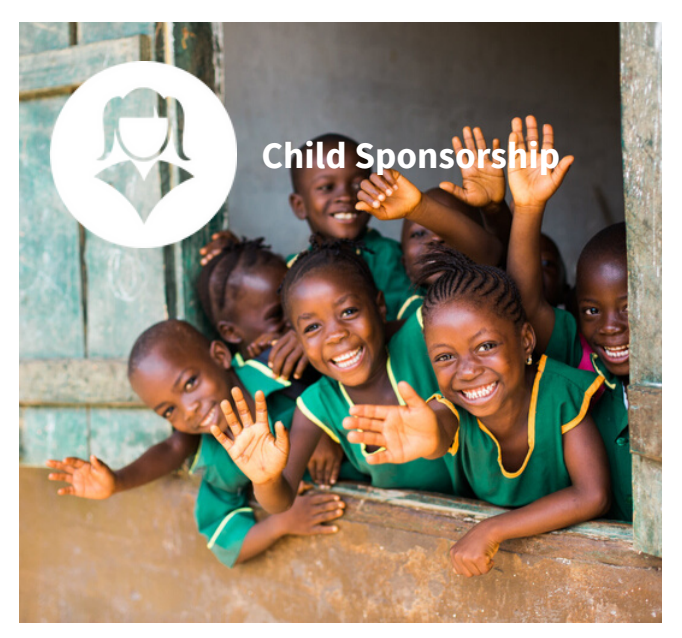
138 sponsors supported the Hope House program in Ukraine

10 goats were distributed in Haiti and the Philippines as an animal multiplication project